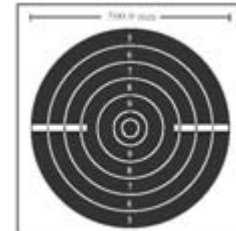
25 Meter Rapid Fire Pistol Target